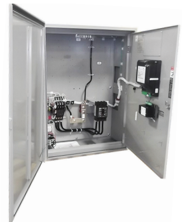
ASCO SERIES 300 SE Rated 200 amperes in Type 3R enclosure

ASCO SERIES 300SE products use two types of construction.