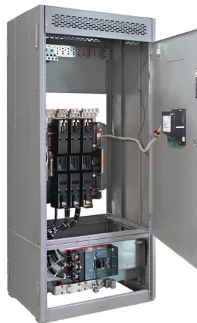
ASCO SERIES 300 SE Rated 800 amperes Type 1 enclosure