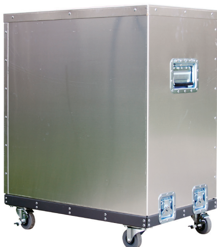
PowerStar 110 with aluminum “slip-over” cover with handles for added protection while transporting.