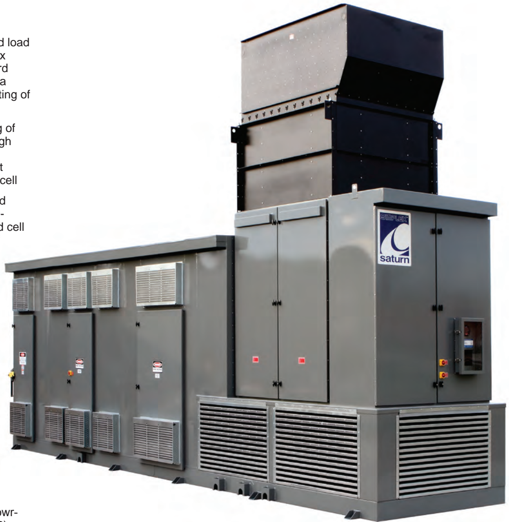
Saturn-HV with optional Sound Attenuated Base