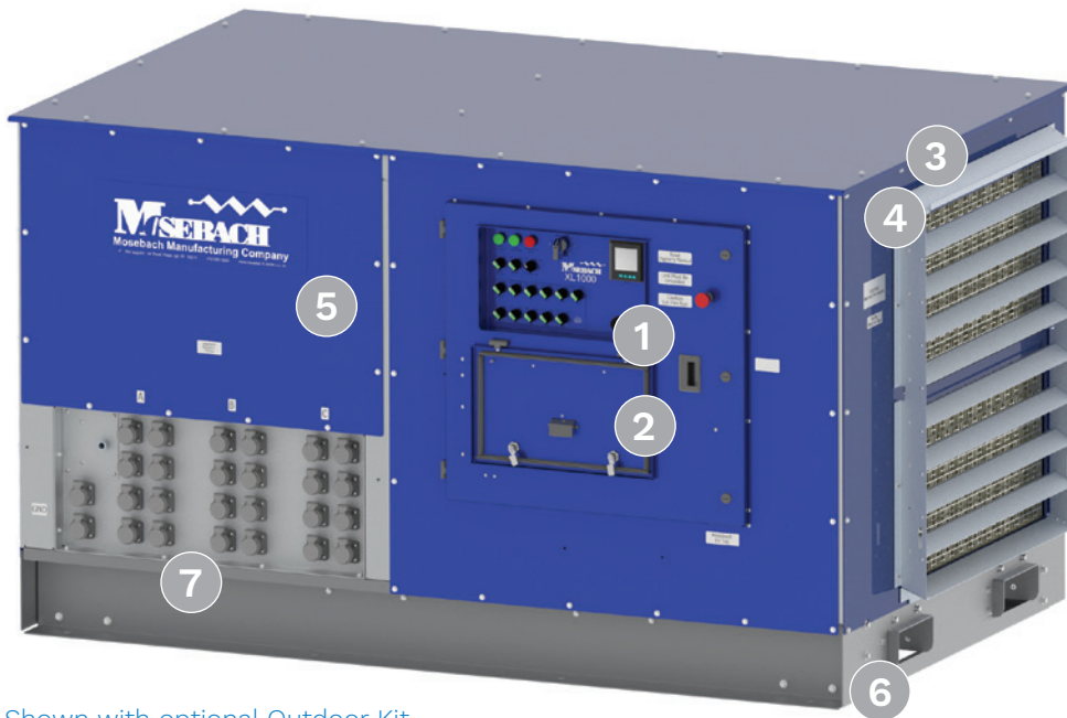
Shown with optional Outdoor Kit

Mosebach XL series of resistive load banks are designed for testing power supplies from 750kW up to 1500kW of various voltages. The XL series is designed for continuous use in the harshest climates and environments.