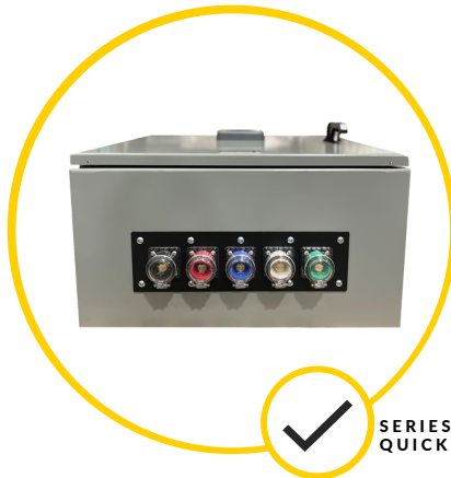
SERIES 16 QUICK CONNECT