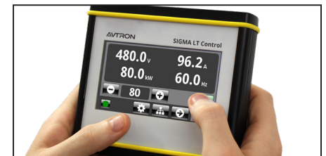
Optional SIGMA LT Hand-Held Terminal.

SIGMA software can be updated free of charge through the Avtron website at the following link .