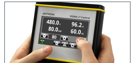
"Digital Toggle" Switch Control Panel and Optional SIGMA LT Hand-Held Controller.