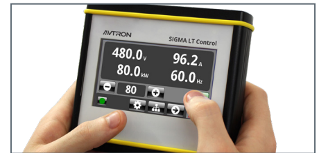
"Digital Toggle" Switch Control Panel and Optional SIGMA LT Hand-Held Controller.