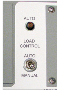
Avtron Automatic Load Control toggle switch shown on load bank control panel.

The Avtron Automatic Load Control is an optional accessory for 1000 SERIES (radiator mount) or 4000 SERIES (outdoor free standing style) load banks.