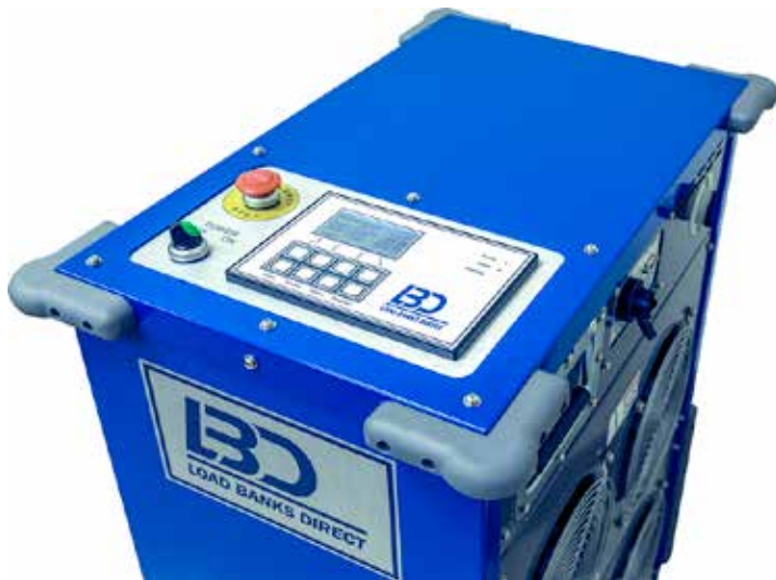
100KW Portable with top mounted Controller

Data Logger Access, Fault Diagnostics and Custom Configuration Setup are available from any screen.