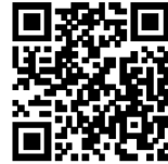
Video: Transfer from primary to backup power