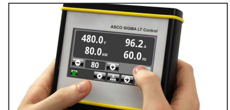
Optional SIGMA LT Hand-Held Terminal.